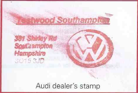
Audi dealer's stamp