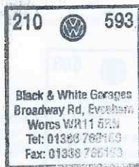
Audi dealer's stamp