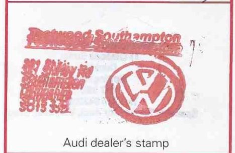
Audi dealer's stamp