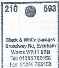
Audi dealer's stamp