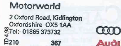
Audi dealer's stamp

Toothed belt replaced Ribbed V-belt replaced Brake fluid changed