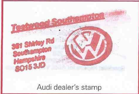
Audi dealer's stamp