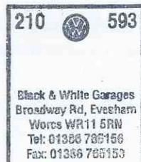
Audi dealer's stamp