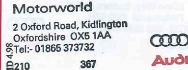
Audi dealer's stamp

Toothed belt replaced Ribbed V-belt replaced Brake fluid changed