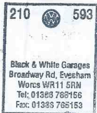
Audi dealer's stamp