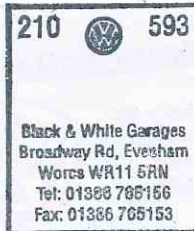
Audi dealer's stamp

Toothed belt replaced Ribbed V-belt replaced Brake fluid changed