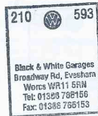
Audi dealer's stamp